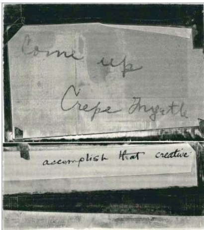
Sincere Endeavors To , 30" x 22 1/2", Monoprint