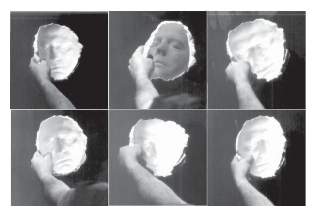
The cyclop's gaze, 2001 Digital print

As in the metaphor of the river, always the same, always different, time presents us a mirrored image that is forever changing: each time we look our face in the mirror, it gives us back a different image. Furthermore, it gives us back a face in which simultaneously the image we see and the one that we have of ourselves projected on it coexist. As Roland Barthes states in Camera Lucida : "What I want, in short, is that my image, buffeted among a thousand shifting photographs, altering with situation and age, should always coincide with my (profound) 'self'; but it is the contrary that must be said: 'myself' never coincides with my image..."