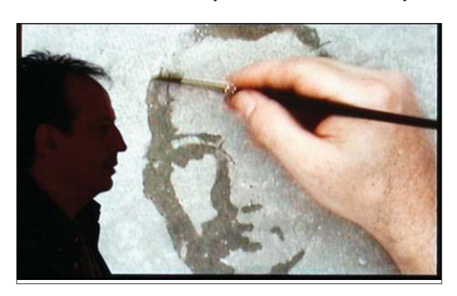
Re/trato (Self-portrait), 2007 Video detail

Re/trato (Self-portrait), as its name suggests, is a reflection about (self) portraiture, but also about constancy and attempt. The video shows us an image that is being constructed incessantly, without a beginning or an end. However, the medium used (water) and the support (a concrete slab in plain sunlight) conspire against the stability of this precarious face. The image starts to disappear in the moment it is being made. The drawing replicates the identity lines of a face in a futile attempt to define it, to fix it once and for all, but the ephemeral image persists in disappearing. As in the myth of Sisyphus, the hand does an effort while knowing that the result of will unavoidably be lost, which means always going back to the departure point in a double act of frustration and tenacity. As seen in his first series, Óscar Muñoz invokes the myth of Narcissus, who died while trying to reach his own image reflected in the water, and I would like to think that there is a bridge between this and Sisyphus, both condemned to the attempt to achieve something beyond their reach. However, punishment can be relativized. Albert Camus notes how Sisyphus' triumph lies in the acknowledgement of his impossible and eternal task—"The clairvoyance that should have constituted his torment, simultaneously consummates his victory"-