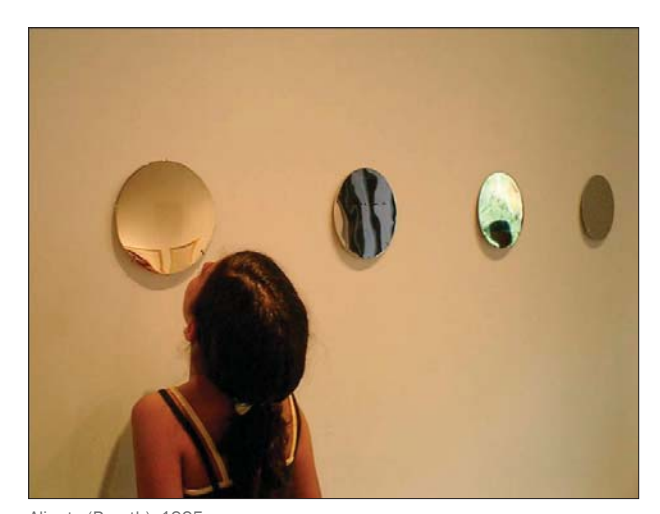
Aliento (Breath), 1995 Mirrors, screen- printed with grease

photography partly satisfies that curiosity. The feeling of being aside from calamity encourages the interest to contemplate painful images, and that contemplation suggests and strengthens the feeling of being safe from danger. Partly because we are 'here' and not 'there,' partly because of the inevitable character any event acquires when it is transmuted into images." (Susan Sontag)