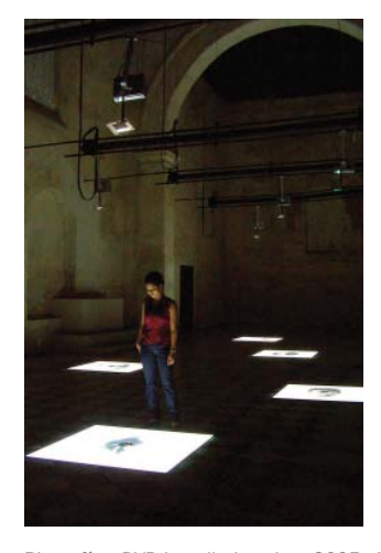
Biografías. DVD Installation view, 2005. Newspapers in Colombia present an endless flow of images where one violent event replaces the previous one, banalizing tragedy and escalating the viewer's resistance to crude images, much in the way a vaccine works.

"These three moments in the process of Narcissus — when the dust touches the water and is turned into an image; the process and changes it undergoes during evaporation; and when the dust finally adheres to the bottom—allude to three definite moments: creation, life and death"