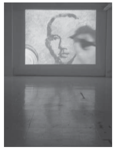
Re/trato (Self-portrait), 2007 Video installation view

because the uncertainty that feeds hope disappears, and with it the possibility for unhappiness: "Overwhelming truths die when they are acknowledged." It is in the acceptance of its imprisoned reality that Narcissism validates its ecstatic and self-contemplative category. Narcissus/Sisyphus, Narcisyphus , restates the myth and perseveres in the attempt, knowing that the achievement of its goal is an impossible task.